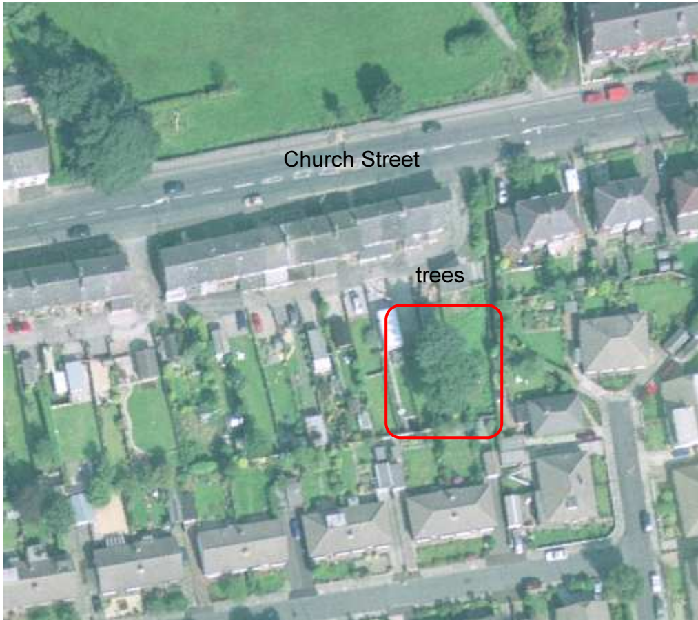
Figure 2: aerial view showing trees to the rear of 72 / 74 Church Street, Ainsworth (not to scale)